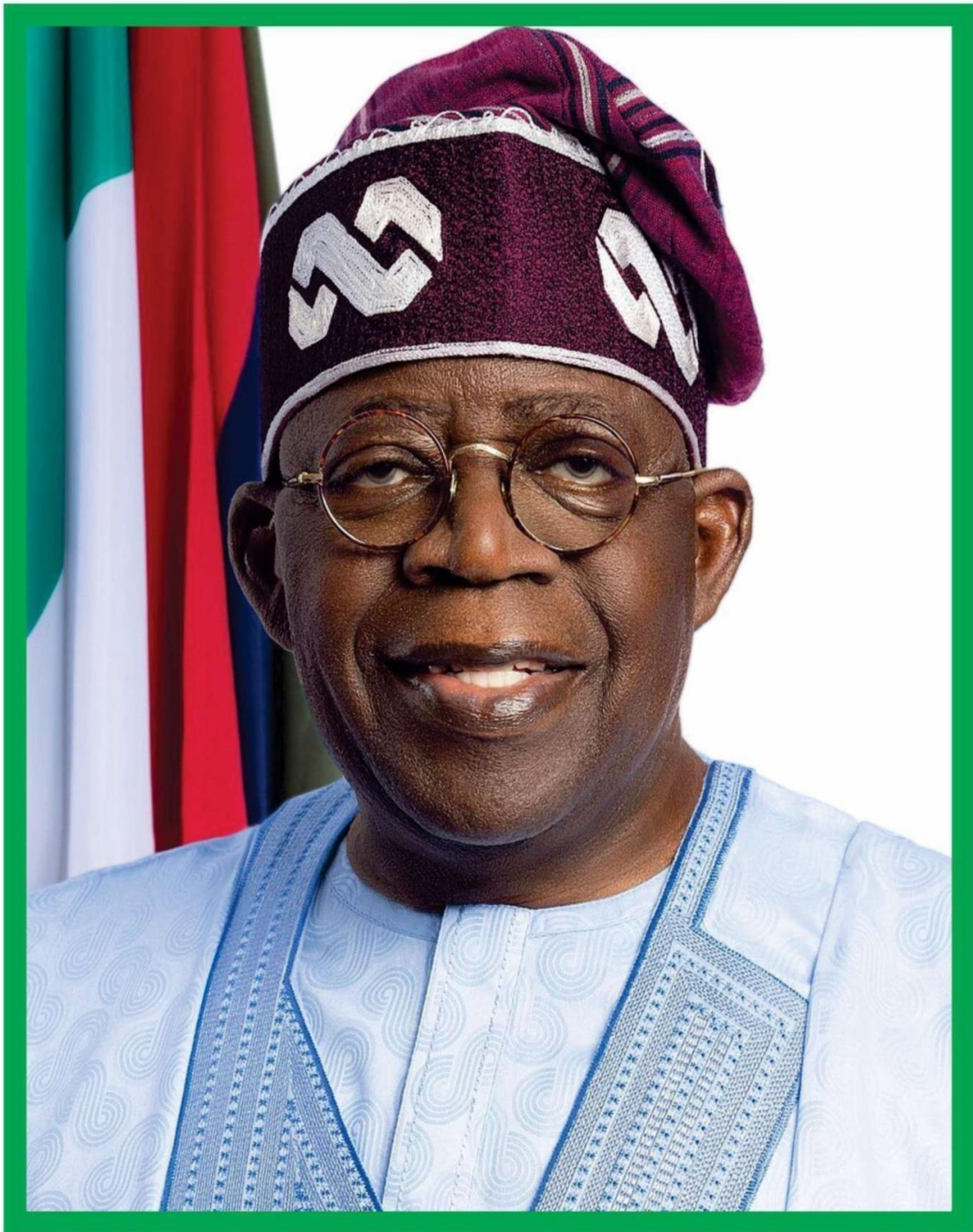
HIS EXCELLENCY BOLA AHMED TINUBU, GCFR President Commander-in Chief Of The Armed Forces Federal Republic If Nigeria