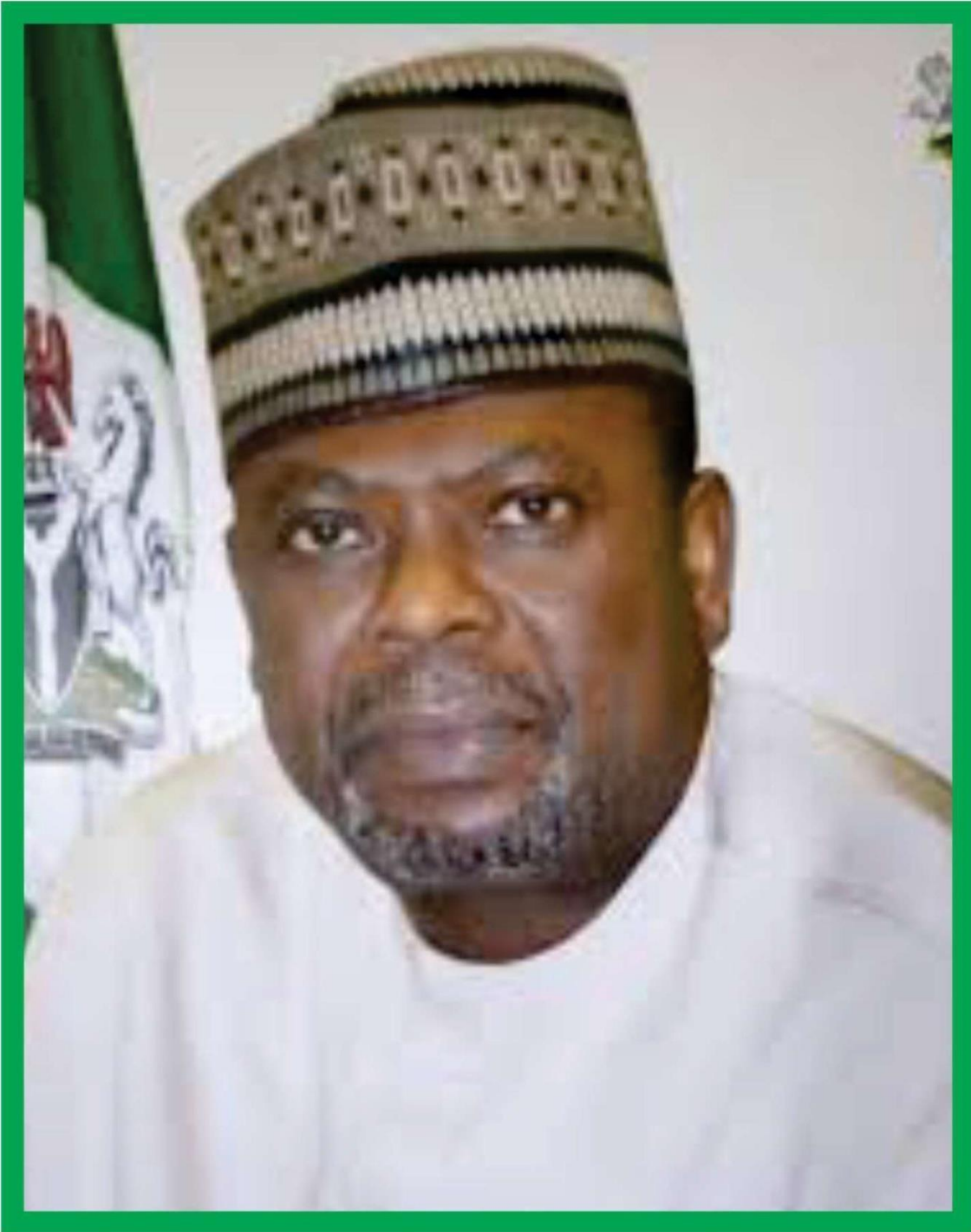
HON. MOHAMMED OMAR BIO Chairman House Committee on Legislative Budget and Research of the National Assembly